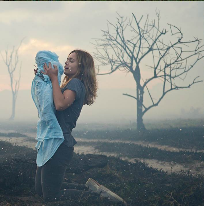
THE CRY Sunday 17 February 8.40pm