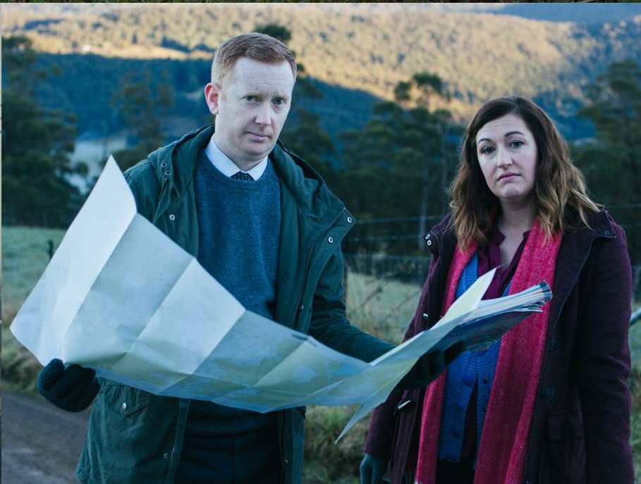
ROSEHAVEN Wednesday 20 February 8.30pm